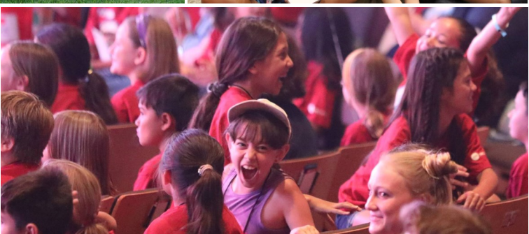
VBS - 11TH STREET BAPTIST CHURCH, UPLAND