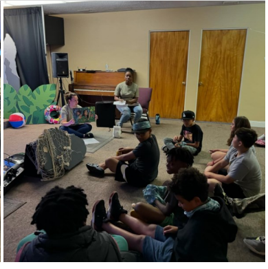
VBS - IMMANUEL BAPTIST CHURCH, HIGHLAND