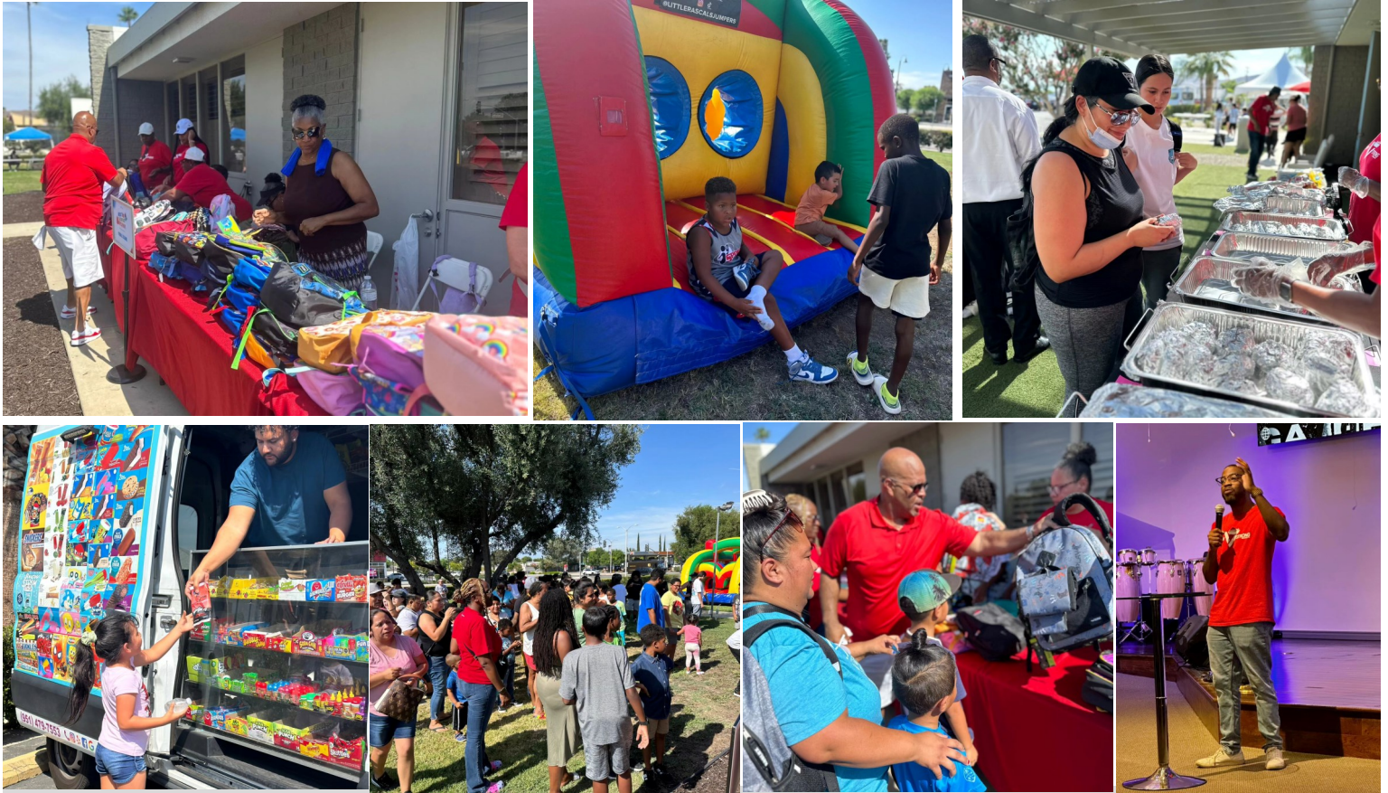
The View Church in Menifee was able to bless hundreds of students in their community with backpacks, school supplies, and gathering families for fun and worship!