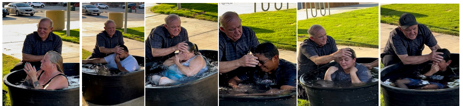
Cabazon Fellowship baptisms!