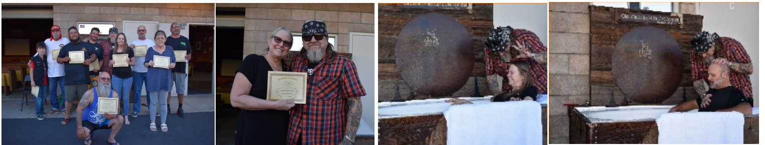
Roadhouse Biker Church in San Bernardino celebrated 10 baptisms!