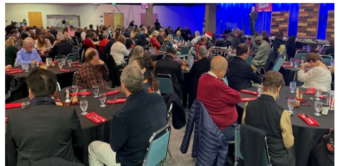
PASTORS CHRISTMAS DINNER 2022